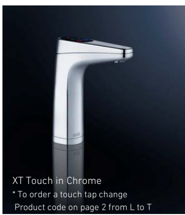
XT Touch in Chrome

Australian designed, manufactured and owned.